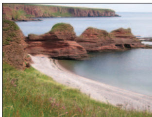
Top: Harbour; Bottom left: Robert Burns Statue; Bottom right: Seaton Cliffs

character, and a number of outside stairs and stone-slatted roofs are still in evidence. The Old Brewhouse looks much as it did when erected by a shipmaster around 1700; in fact it has been completely rebuilt. "Danger Point" is an ironic comment upon the sea's encroachment here; originally two more houses stood between the Old Brewhouse and the shore. These houses were once the targets of Captain Fall's pirate attack on the town and harbour in 1781.