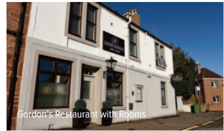
Gordon's Restaurant with Rooms